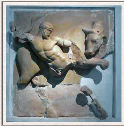
Metope from the Temple of Zeus at Olympia. Heracles taming the Cretan bull.

The panels were decorated with paintings or sculptures, which were made to tell stories of the myths related to the God to whom the temple belonged or to the local hero.