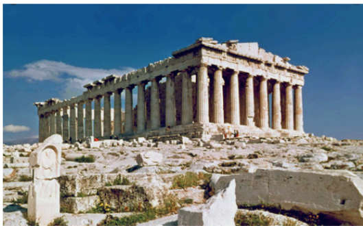
The Parthenon, Athens