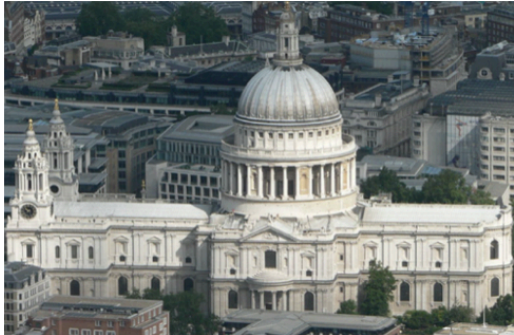
St Paul's Cathedral

Draw out a table and list the similarities and differences based on what you saw in the video clips.