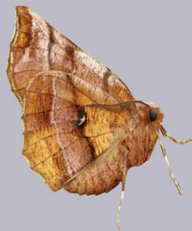
Early Thorn moth