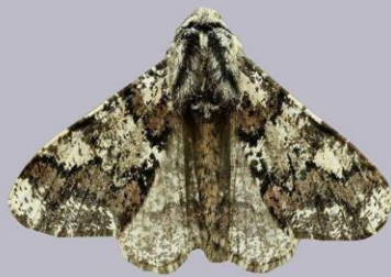
Oak Beauty moth