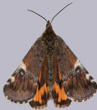
Orange Underwing moth