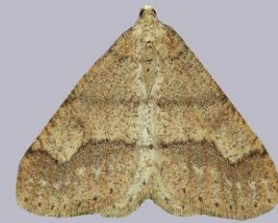
Dotted Border moth